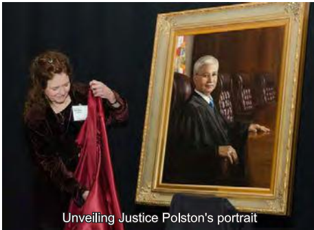
Unveiling Justice Polston's portrait