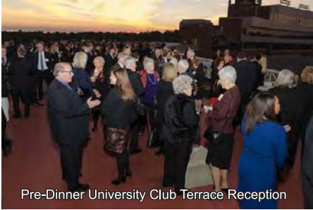
Pre-Dinner University Club Terrace Reception

Please visit us online at www.flcourthistory.org to see more photos and video highlights from our 2015 Annual Dinner