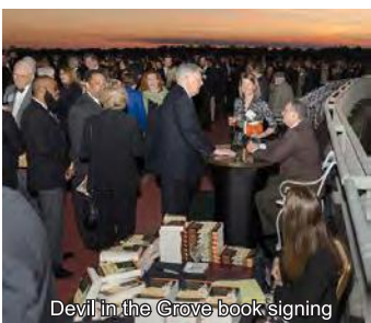
Devil in the Grove book signing