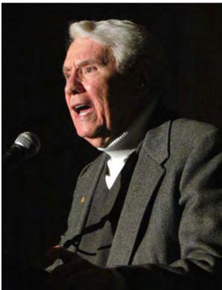
An interview was held with the now late, former Governor Reubin Askew

As often happens when undertaking this type of project, we also educated ourselves in the process.