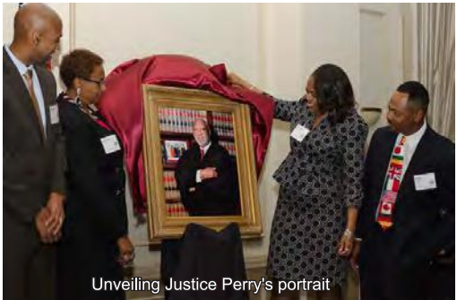
Unveiling Justice Perry's portrait