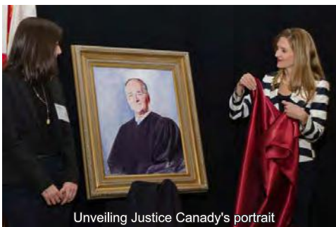
Unveiling Justice Canady's portrait