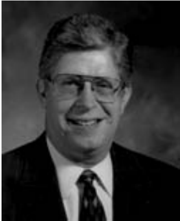
Park Trammell Society Executive Director

We're about to ring down the curtain on 2003 -- a very busy year for the Society by any measure.